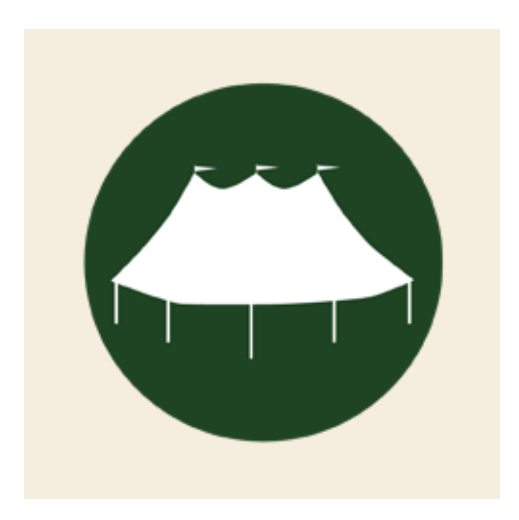
A proud partner of Sperry Tents UK, the original sailcloth tent.