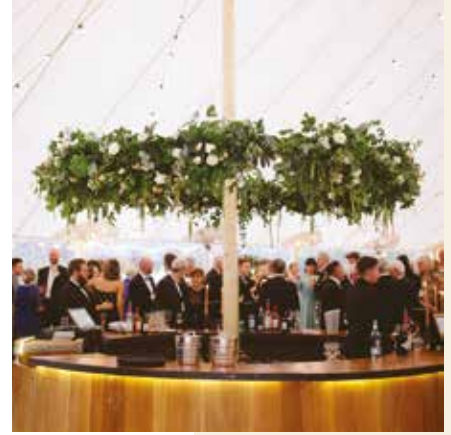
3m Floral Hoop