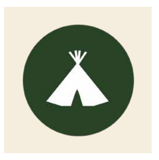
Using only the very best industry products for our Tipis.