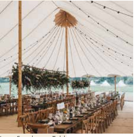
Long Farmhouse Tables