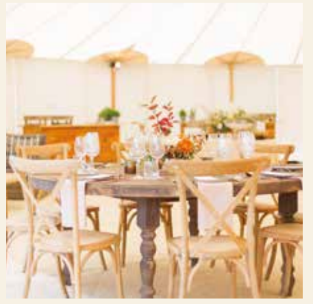
Round Farmhouse Tables