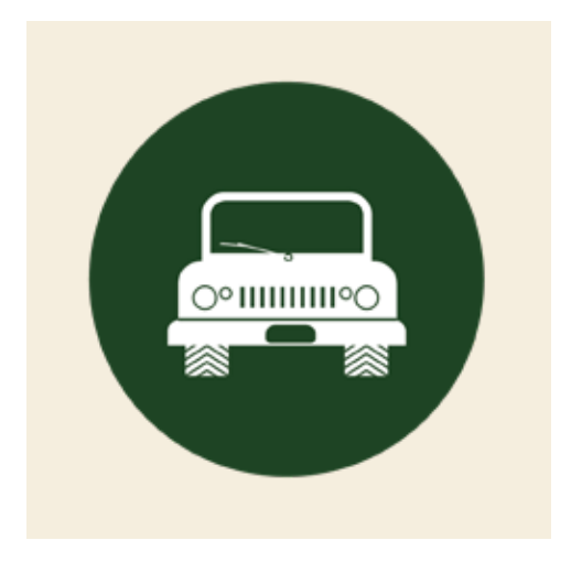
The team have successfully delivered over 3,000 amazing events.