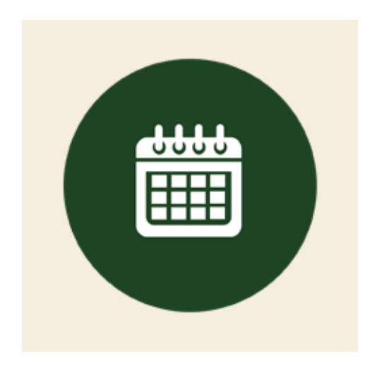
A dedicated and enthusiastic team that understand just how important every aspect of your event is.