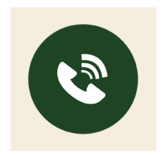
24/7 Call out - for peace of mind during your event.