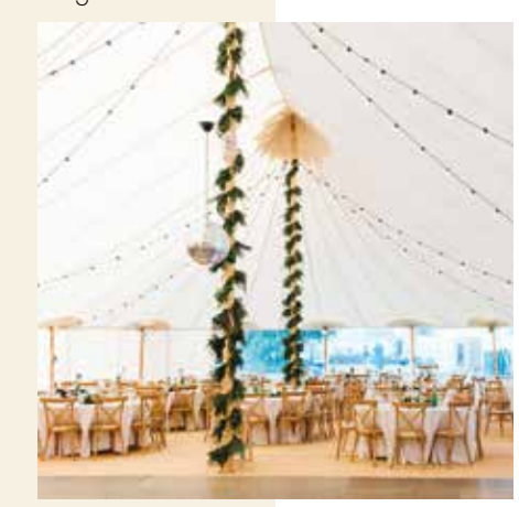
Sperry Mirror Ball