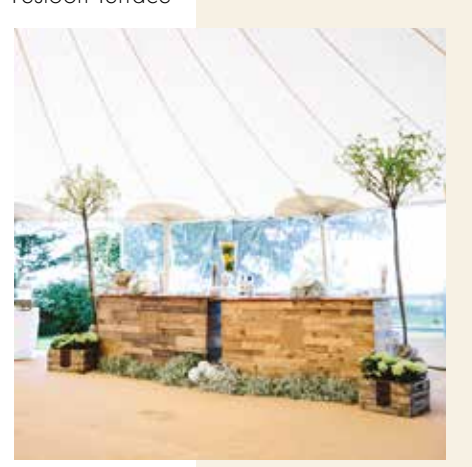
Reclaimed Oak Bar